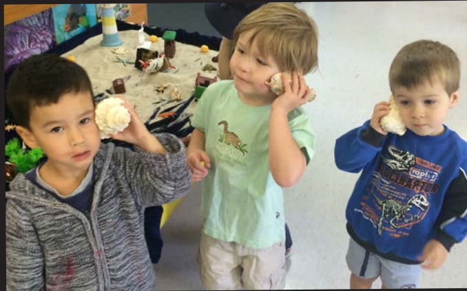
LORD OF THE FLIES