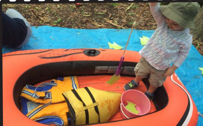
LIFE OF PI