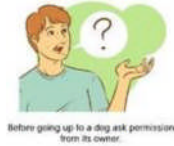
Before going up to a dog ask permission from its owner.