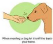
When meeting a dog let it sniff the back of your hand.

We also celebrated the special people in our lives and had a Mother's Day afternoon tea celebration with both the Stars and Rainbows. The children all had the opportunity to show their special visitor what they have been doing at kinder by looking through their memory books together, participating in some activities and getting to spend some time together.